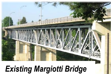
Existing Margiotti Bridge

The existing bridge was constructed in 1937 and was comprised of seven spans that included three 172-ft single span deck trusses and two adjacent box beams spans at each end of the bridge.